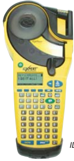
IDXpert ABC style keyboard