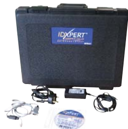
Brady IDXpert accessories