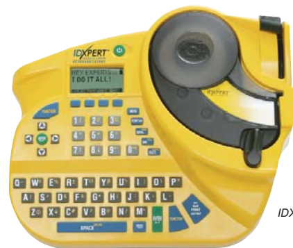
IDXpert QWERTY keyboard

The IDXpert is available in two styles. The ABC layout is the ideal choice to labelling on-the-go and out in the field, while the QWERTY layout offers you the advantages of a QWERTY keyboard.